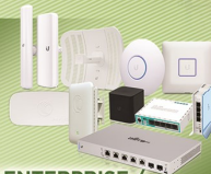
WIFI ENTERPRISE / NETWORKING / WIRELESS BROADBAND